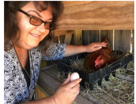
GATHERING EGGS —and sometimes petting a chicken—is part of daily life at Dona Marie House , where daytime members mix with full time residents.