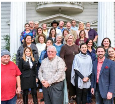
GALA COMMITTEE includes volunteers from our staff, residents, Clubhouse members, and the Greater Houston Community.