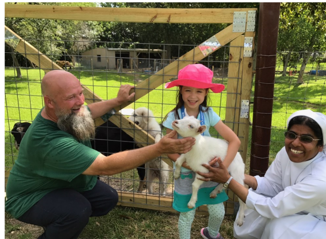
DOWN-ON-THE-FARM PLAYDATES offer families of residents, members and staff quality time together.

In planning are skills training courses, rehabilitative programs, workdays, play days, and spiritual retreats.