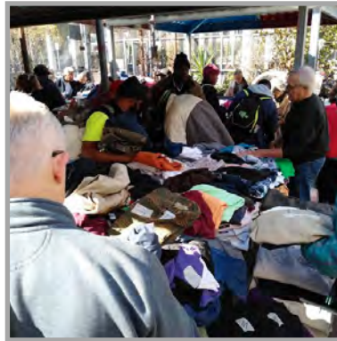
...and feeding 250 a day at our Loaves & Fishes soup kitchen. (Here we host a clothing distribution in its courtyard.)