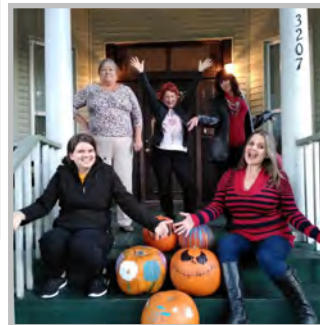
...and making sure our residential community experiences holidays and birthdays

Thank you for all you do to support our mission!