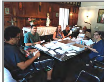
...and assisting Clubhouse Members to gain marketable skills