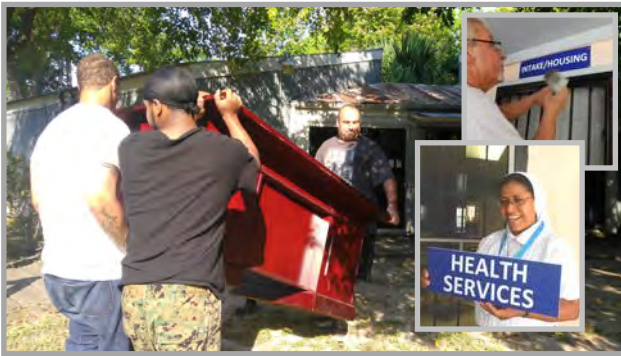
... moving our Admissions Offices to 3209 Austin Street, which processes over 100 residential applicants per month