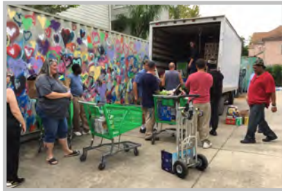
...and supplying our 16 group homes with food and goods 24/7.