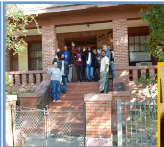
ABOVE: SOME OF THE MEN being sponsored during their movement toward independence, residents of Bethany House (L) and Maranatha House.