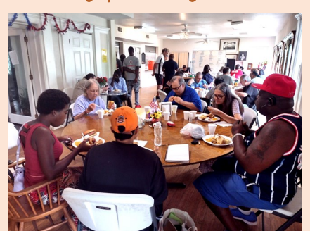
...the return of the Labor Day Picnic Lunch-on the actual date celebrated nationally-a Clubhouse standard.